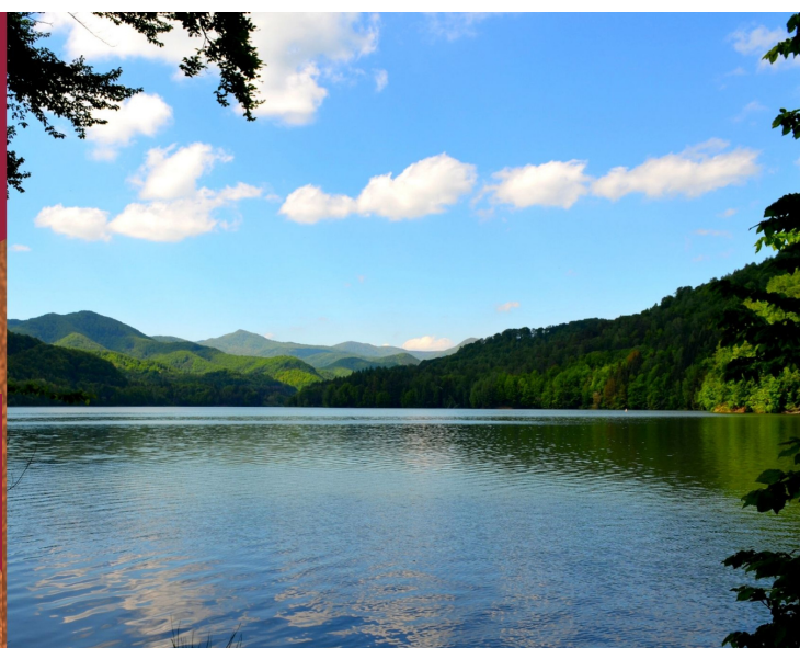
BIG LAKE - SAPPHIRE MARELE LAC - SAFIR