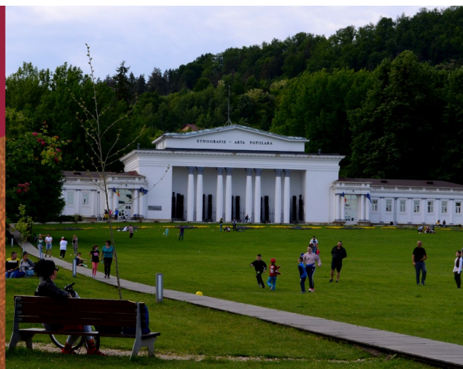
MUSEUM - WHITE MUZEU - ALB

After taking around 30 photos, I prepared an exhibition for the public in Bastionul Măcelarilor for 4 weeks, in which people could see the photos and also get to know a little about me.